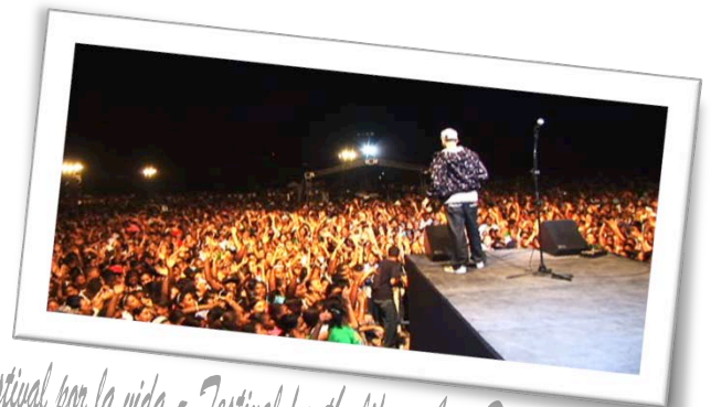
Festival por la vida - Festival for the life - Azua Dominican Republic